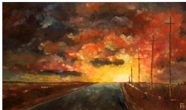
Tunnel by Ernie Dexter, used with permission of the artist.